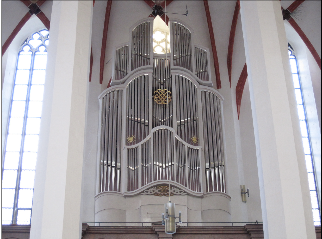
The Bach Organ